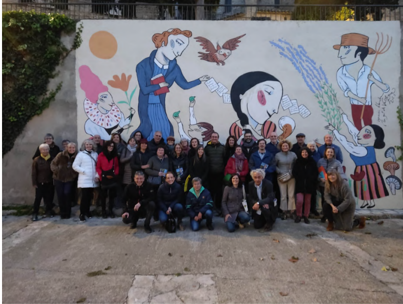
Picture 3. Annual autumn conference: The art of telling stories. The importance of reading aloud , 2023.

b) We also run different projects to promote the knowledge of Catalan literature in society: