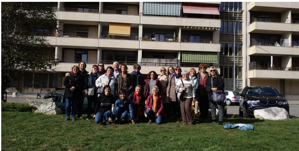
Picture 4. The Geneve of Aurora Bertrana and Mercè Rodoreda. One city, two writers, Literary Journey 2023.

We also organise annual literary journeys that delve deeper into the connections between specific works and their geographical inspirations.